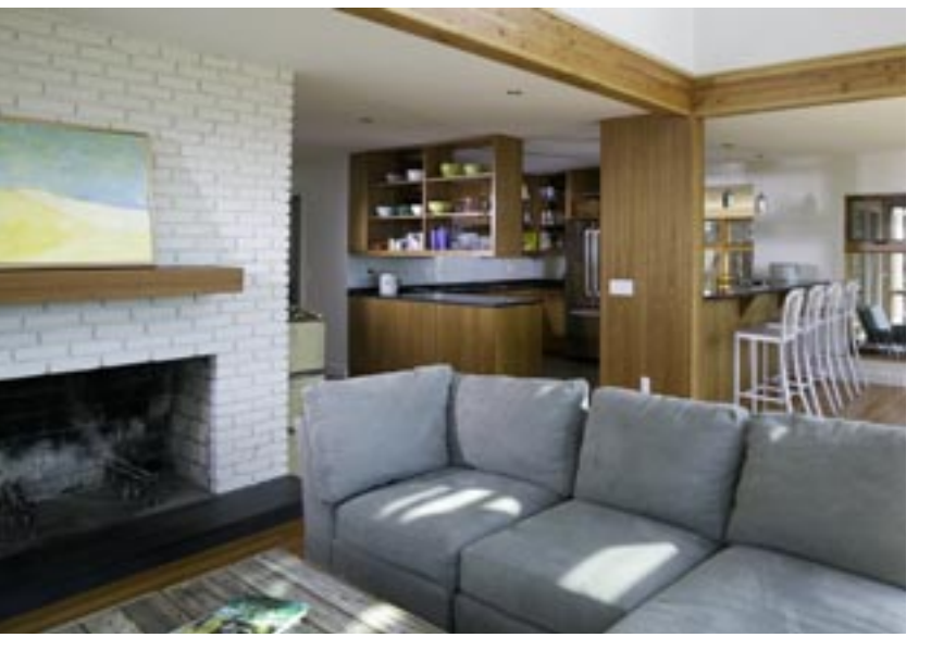
Bayview Beach Residence